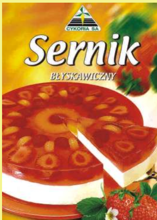
► Instant cheesecake (160 g)