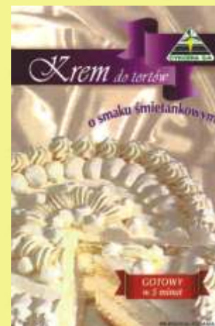
► cream flavor (100 g)