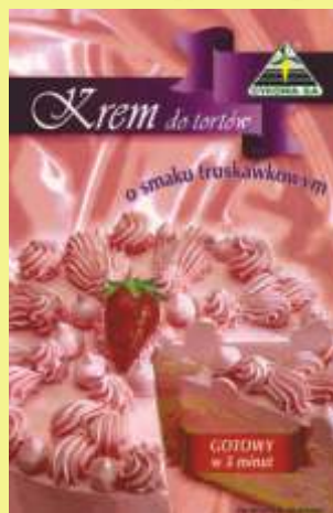
► strawberry flavor (100 g)