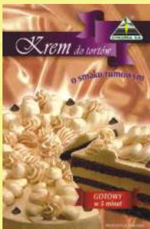
► rum flavor (100 g)