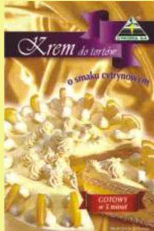
► lemon flavor (100 g)