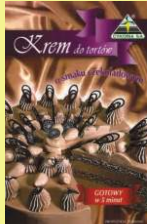
► chocolate flavor (100 g)