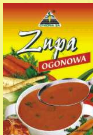
▶ Ox-tail soup (50 g)