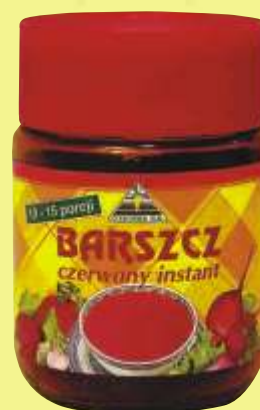
► Instant red borscht (120 g)