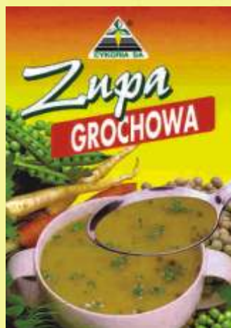
▶ Pea soup (70 g)