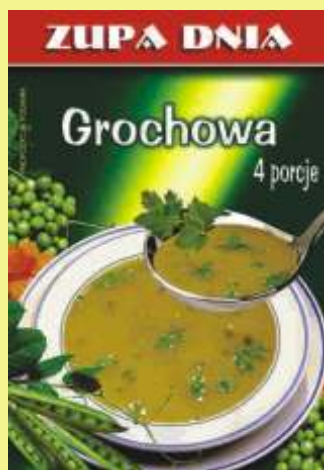
▶ Pea soup (50 g)