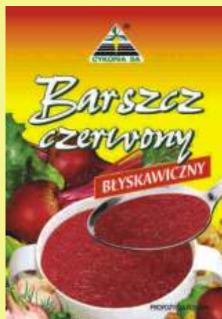
► Quick red borscht (60 g)