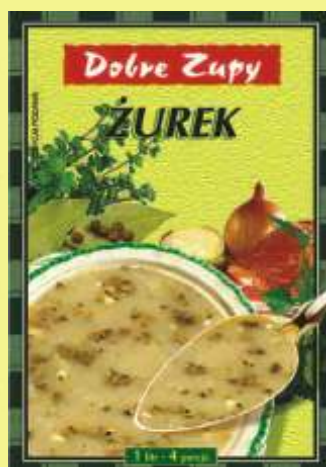
▶ Sour rye soup (50 g)