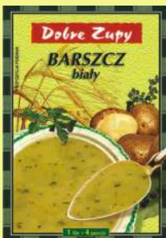
▶ White borscht (60 g)