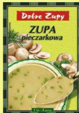
▶ Champignon soup (60 g)