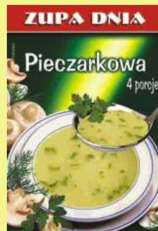
▶ Champignon soup (60 g)