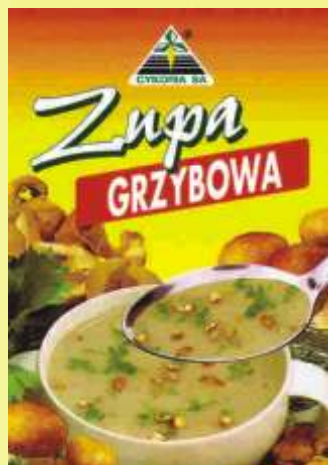
▶ Mushroom soup (40 g)