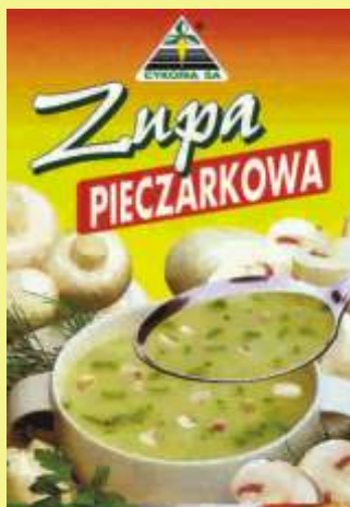
▶ Champignon soup (40 g)