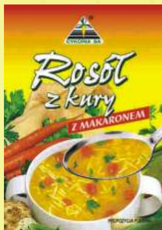
▶ Chicken soup with noodles (50 g)