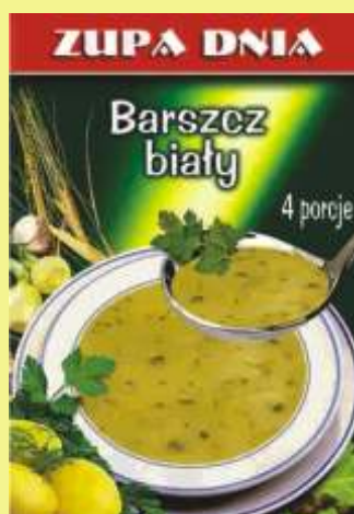
▶ White borscht (60 g)