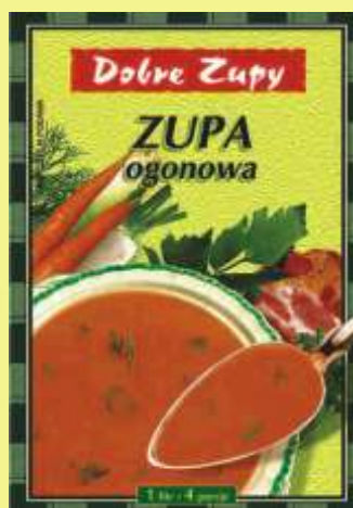
▶ Ox-tail soup (50 g)