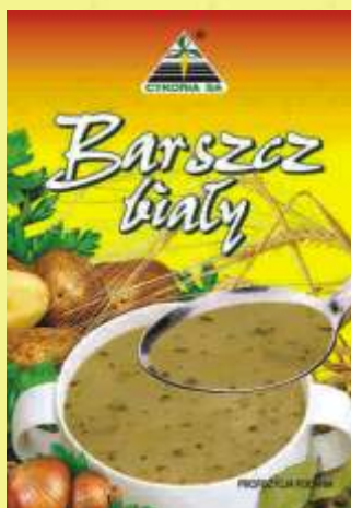
▶ White borscht (40 g)