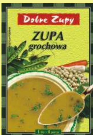
▶ Pea soup (50 g)