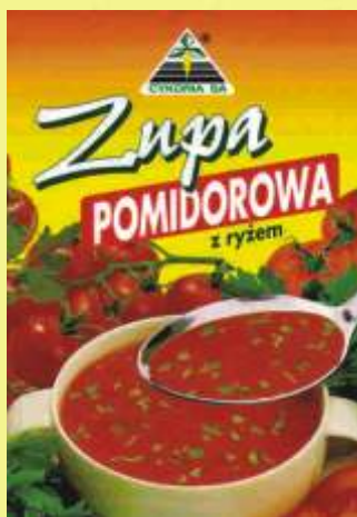
▶ Tomato soup with rice (50 g)