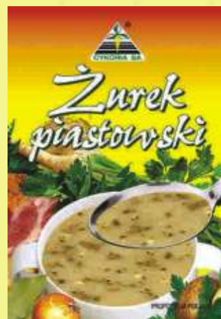
▶ Piast sour rye soup (40 g)