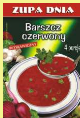
▶ Instant red borscht (35 g)