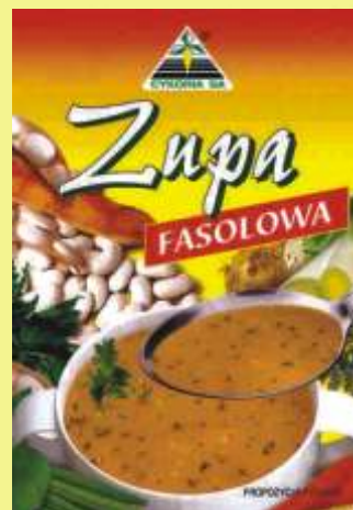
▶ Bean soup (50 g)