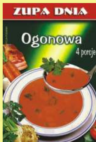
▶ Ox-tail soup (50 g)