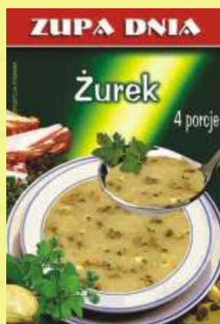
▶ Sour rye soup (50 g)