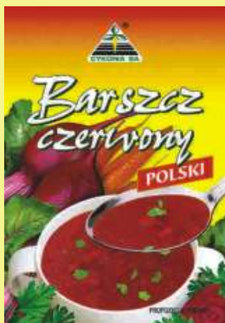
► Polish red borscht (45 g)