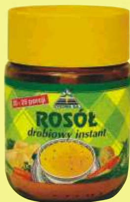
► Instant chicken broth (120 g)

Dry soup mixes can be distinguished for their long expiration date and great taste that is close to homemade meals. Easy and quick in preparation at work and camping. The highest quality, aesthetic packaging, competitive price are the strongest points of our dry soup mixes.